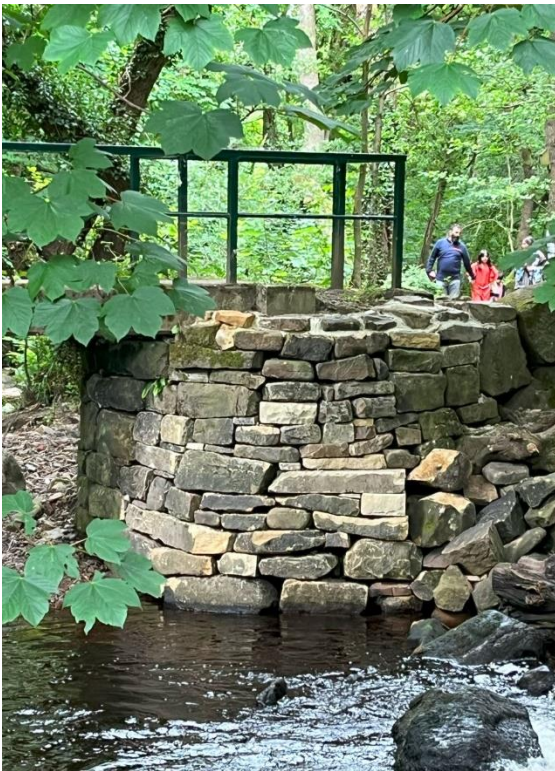
Sheffield City Council repairs to the foundation of the bridge at Hind Wheel