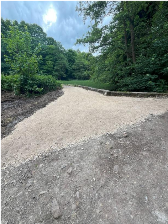
Hind Wheel (East) repaired by Sheffield City Council June 24