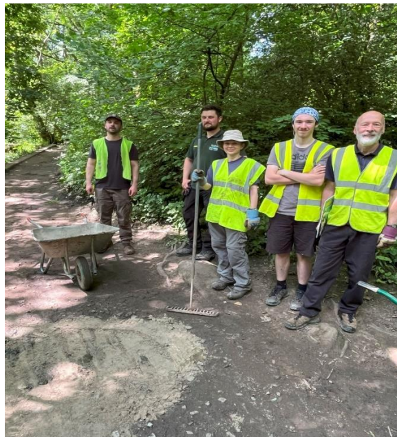
After an exhausting day and with the final hole filled, the task team volunteers still manage to raise a smile.

Future task team events will focus efforts on footpath repairs at Holme Head Wheel in the section between the S-bend and Rivelin Park, and we will also be returning to Rivelin Corn Mill where the dipping platform built in 2006 by the RVCG is showing serious signs of deterioration. The inaccessible head goit has not been cleared since storm Babet and now that river levels have dropped, the flow of water into Rivelin Corn Mill is at an all-time low. This is being addressed by Ranger Ryan