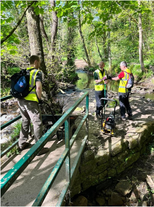
Footpath repairs at Swallow Wheel weir