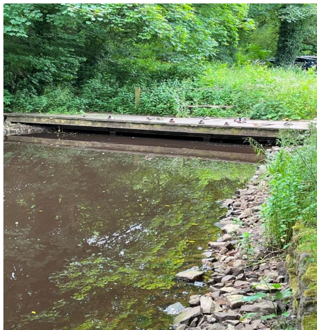
Rivelin Corn Mill needing a bit of TLC Graham Appleby, Task Team Leader

Future task team events will focus efforts on footpath repairs at Holme Head Wheel in the section between the S-bend and Rivelin Park, and we will also be returning to Rivelin Corn Mill where the dipping platform built in 2006 by the RVCG is showing serious signs of deterioration. The inaccessible head goit has not been cleared since storm Babet and now that river levels have dropped, the flow of water into Rivelin Corn Mill is at an all-time low. This is being addressed by Ranger Ryan