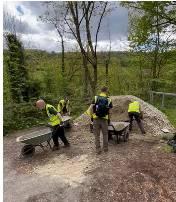
20 tons of gritstone is steadily barrowed away to the Valley bottom.