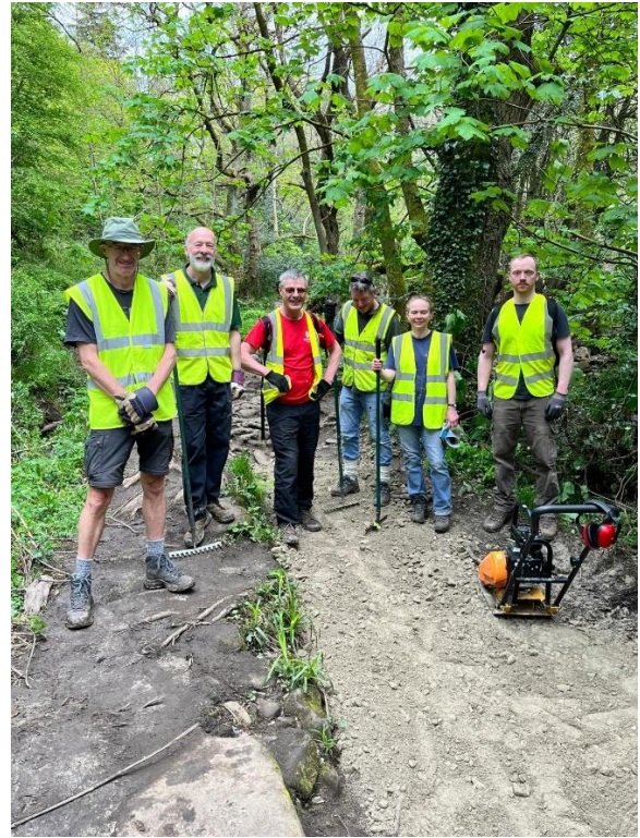
A few members of the RVCG Task Team take a well-earned break for the camera

The April Task Day was deferred for one week until 5 th May due to heavy rain. A group of 14 volunteers were given the task of moving 20 tons of grit stone (provided by Sheffield Council) in wheelbarrows down to the nature trail beginning at Swallow Wheel and began the long arduous job of resurfacing the footpath.