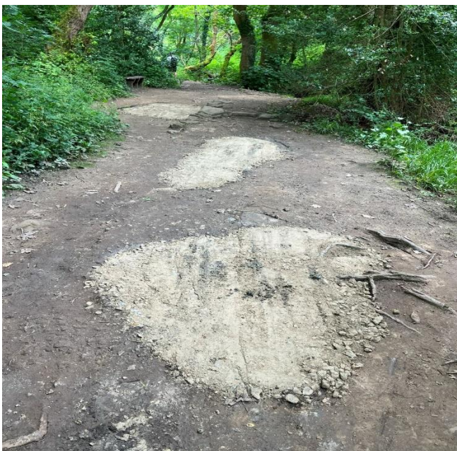
Similar section following repairs