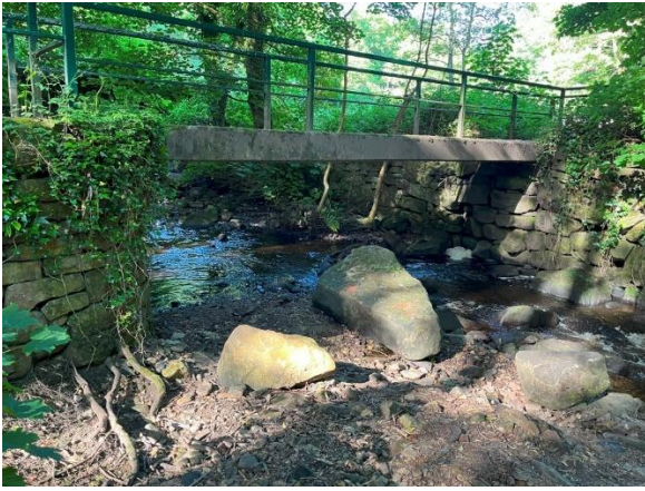
Huge stones washed down by the October flood under the bridge at Hind Wheel