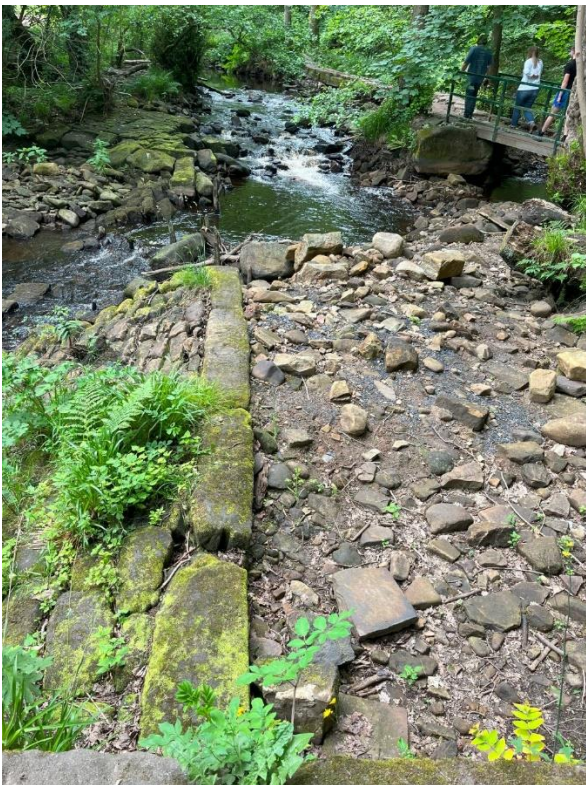
Swallow Wheel head goit completely blocked with grit and rocks and showing the weir washed away in the background. There is no water flow here anymore and sadly the dam will slowly dry out.