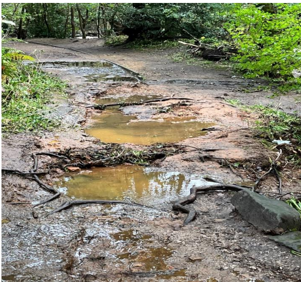
A section of Rivelin Valley nature trail prior to the June task day

RVCG task team had restored over a mile of footpaths, and this would be the final section in the upper Rivelin Valley. However, the distance between the grit supply and the work area was increasing and a barrow run was now taking over 10 mins which was exhausting on a very warm day only slightly tempered by the shade of the trees.