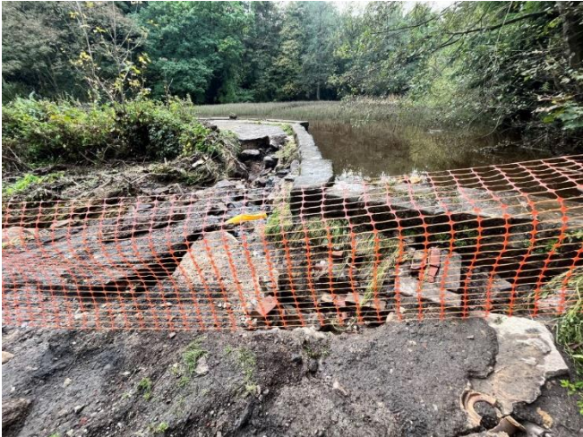
Hind Wheel (East) flood damage Oct 23

Since the devastation of storm Babet in October 23, the RVCG Task Team have been restoring the Rivelin nature trail between Rivelin Corn Mill at Rails Road and Glen Bridge known locally as the 'S bend' where Rivelin Valley Road crosses the Rivelin. This is now all complete as far as Hind Wheel which itself has been restored by Sheffield City Council. The final section between Hind Wheel and Glen Bridge remains closed. The damage to this section was extreme and repairs are beyond the capability of the RVCG task team and SCC contractors will be required to restore this section.