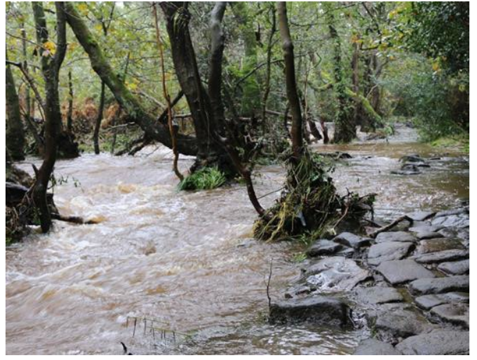
Left – Hollins bridge with flood waters almost at the arch. Right– water on Saturday 21 st covering the Rivelin Trail up valley from Hind wheel.