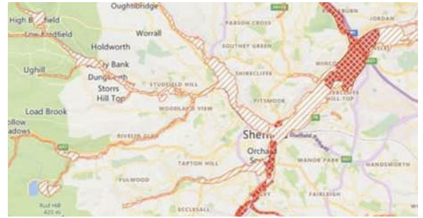
Environment Agency flood warnings for Rivers Don, Sheaf and Porter Brook as of 2pm Friday 20 th October 2023

Storm Babet arrived in Sheffield in the early hours of Friday 20 th October. It rained continually and heavily until 9 am on Saturday 21 st . In this period the weather station at Weston Park recorded 66 mm of rain had fallen in less than twenty-four hours. To put this in context Sheffield on average receives 831 mm of rain in a year and normally the entire month of October sees 78 mm of rain. This is similar to the rainfall received during the Sheffield floods of 2007. Then ~88 mm fell on 14 th June and a further 51 mm fell on 25 th June in a short period of time. During Babet Aberdeenshire was, as predicted, hit the worst with ~250 mm of rain falling around Brechin causing widespread flooding of properties.