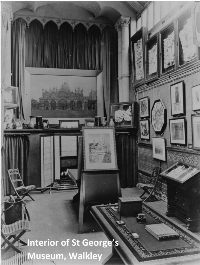
Interior of St George's Museum, Walkley

The St George's Museum in Walkley was founded in Sheffield in 1875 by the Victorian philanthropist and philosopher, John Ruskin.