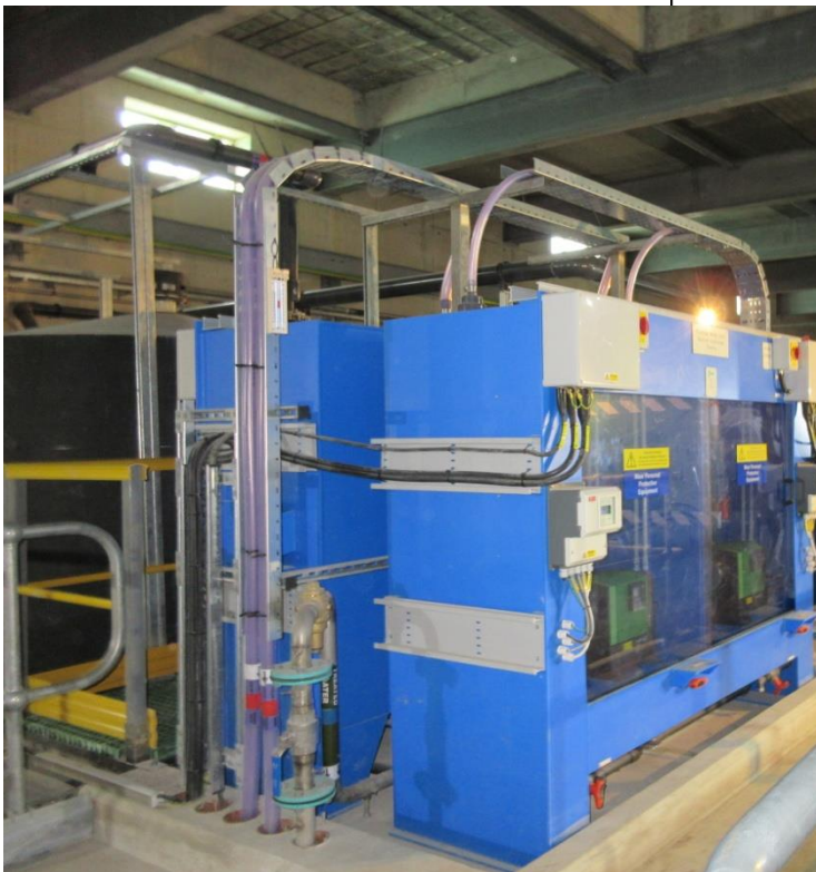
Part of the chemical dosing system

This £25 million project has, under test conditions, already achieved the maximum designed output of 75 million litres /day (16.5 million gallons/day). The maximum output can only be achieved when sufficient raw water stocks are available and at the time of the visit the output was of the order of 50 ml/d (11 mg/d).