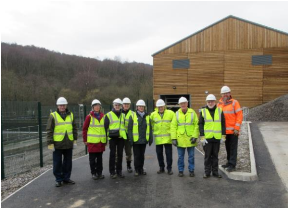
Site visit – new filter house in the background

The RVCG Committee were kindly invited by Yorkshire Water to visit the site on the 6 th February 2018 to view the process upgrades and on-going site landscaping.