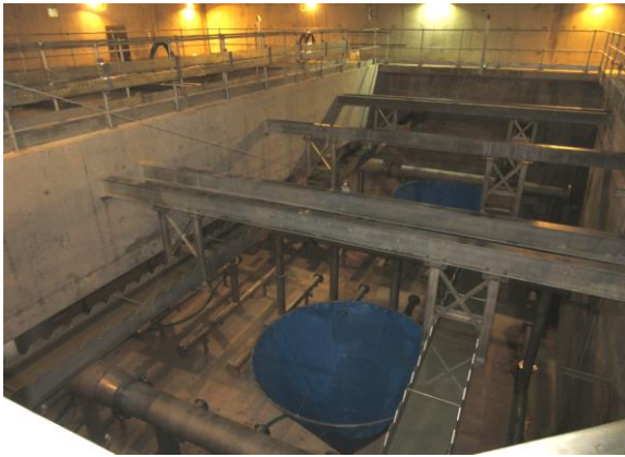
Empty clarifier showing the low level inlet pipework and the high level draw-off troughs, together with the blue sludge cones to remove sludge from the sludge blanket.

This £25 million project has, under test conditions, already achieved the maximum designed output of 75 million litres /day (16.5 million gallons/day). The maximum output can only be achieved when sufficient raw water stocks are available and at the time of the visit the output was of the order of 50 ml/d (11 mg/d).